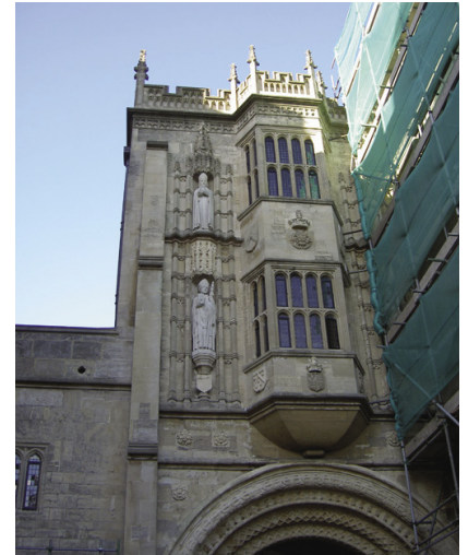
South face of gatehouse after cleaning and conservation