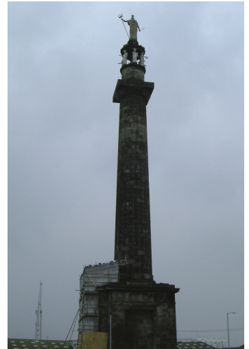
Pillar prior to erection of scaffold